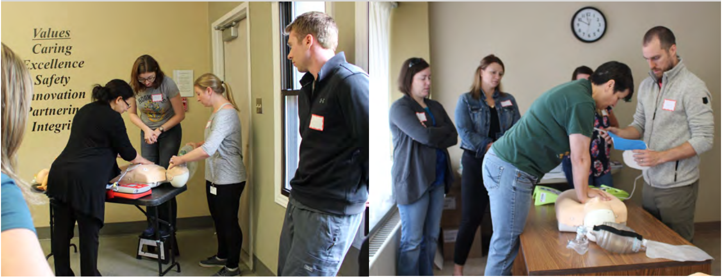
On June 6, the Deep River and District Hospital hosted a Pediatric Advanced Life Support (PALS) course. The Doctors and Nurses who participated paid for the course themselves to improve care for our pediatric clients.