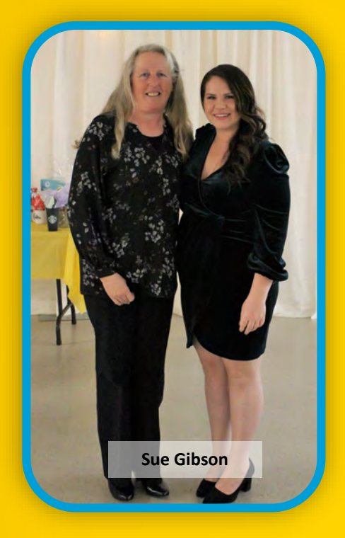
30 Years *as of December 31, 2020