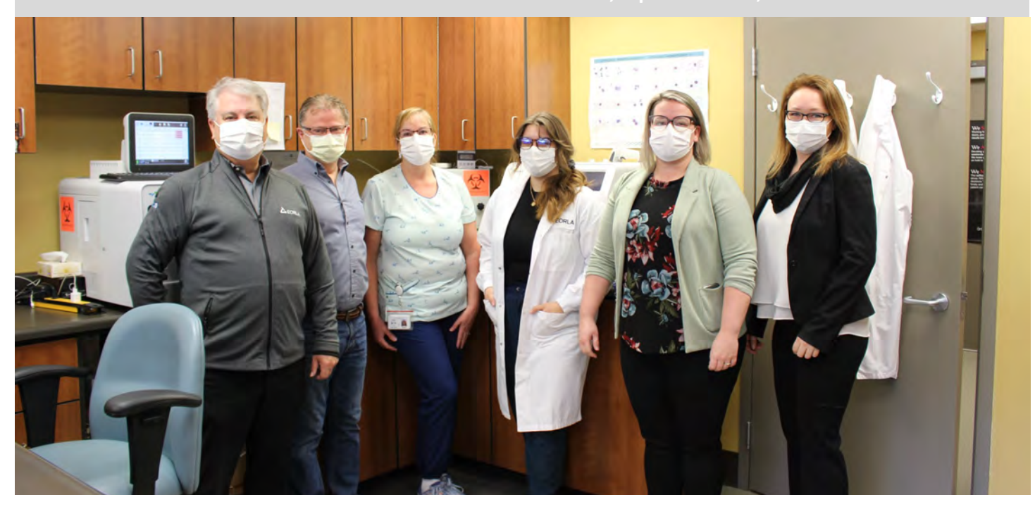
Happy Medical Laboratory Professionals Week!

HAPPY NATIONAL LABORATORY PROFESSIONALS WEEK, April 10-16, 2022