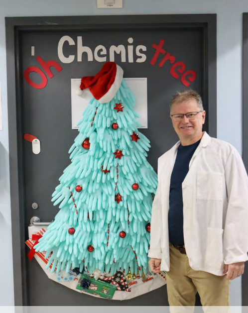
Congratulations to the Lab for winning the door decorating contest!

The DRDH Social Committee coordinated fun festivities for our team all month long, including a department / door decorating contest, a gingerbread house decorating contest, a mobile hot chocolate bar, red and green day, find the elf game, ugly sweater day, a mobile candy cart, 12 Days of Christmas giveaways, and more!