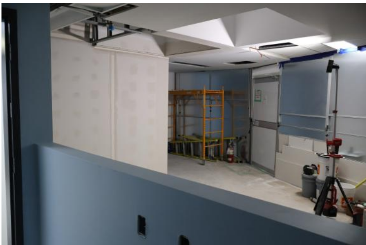
The former cafeteria space located behind the old reception desk is nearing completion of its renovation.