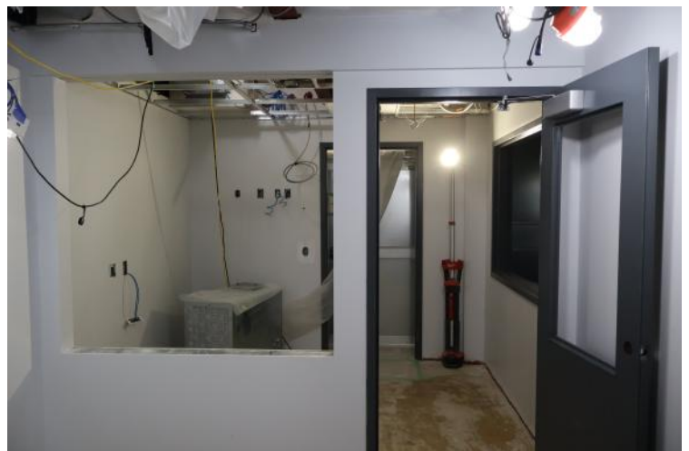
The new reception area will feature enhanced privacy for patients.