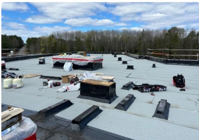
Roofing membrane has been installed and the granular base finish is at 90% completion.

As of June 2026, construction of the new long-term care home continues to advance steadily, with overall project completion now reaching approximately 65%. Interior work includes drywall installation, and mechanical and electrical room construction, which are 90% complete. Exterior work has also continued at a strong pace, including roofing, window systems, exterior glass installation, and weatherproofing components.