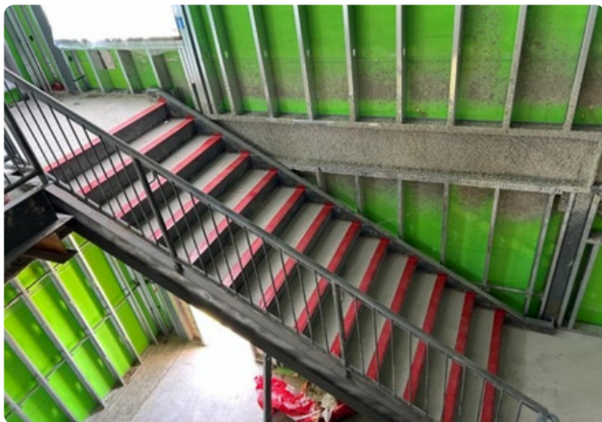
Milestone reached: All staircase concrete work was poured and completed in May. Red tape currently covers the yellow nose strips.