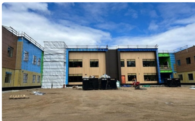
View of the rear courtyard area with cladding installation in progress.