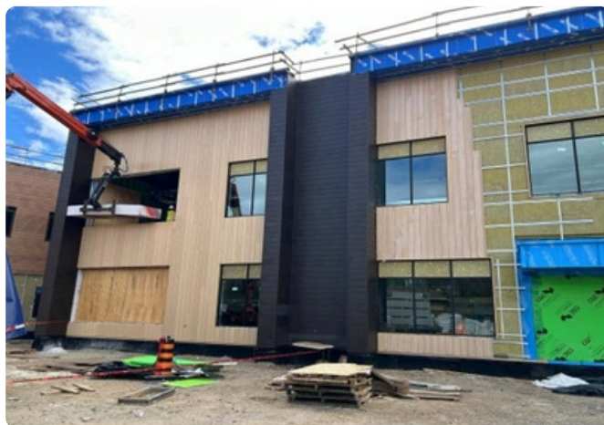
View of the front entrance with cladding install in progress, and dry wall shipment being received through the window.