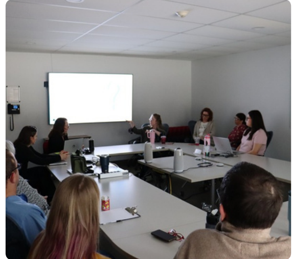
DRDH Teams meeting to evaluate readiness progress.

Before residents can move into the new home, a number of provincial requirements must be met, including inspections, operational planning, staffing readiness, and resident care and safety programs. DRDH teams are actively working with government partners and project consultants to meet these requirements and are approaching an important milestone, with several key plans, checklists, and operational submissions nearing completion.