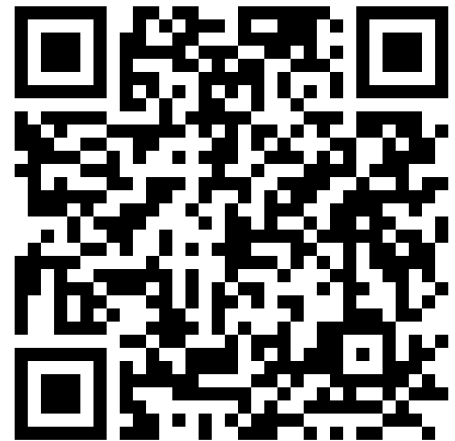
Sign up for our Career Alerts!

Over the next year, DRDH expects to welcome approximately 180 to 200 new team members across a variety of clinical, support, leadership, and service roles.